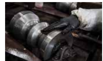
Ultrasonic Cleaning - BELFOR Industrial Dip Line Precision Equipment, Machinery, and Electronics Recovery