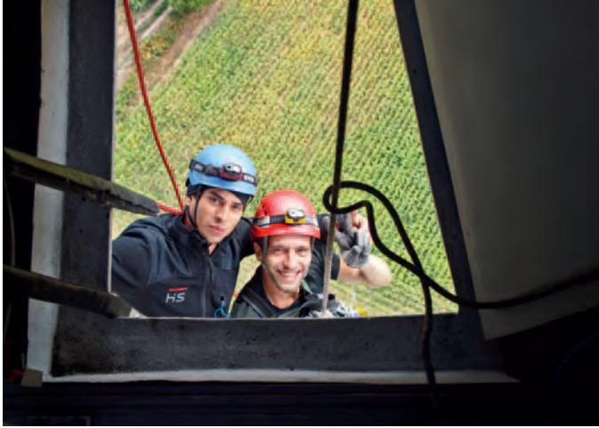
A head for heights is essential: climbers in action

The severely contaminated nacelles were then partially dismantled, loaded onto transporters and taken to Germany, to BELFOR DeHaDe's main repair factory in Hamm (Westphalia). With specialist equipment and machinery restoration expertise at the factory, the nacelles were thoroughly cleaned and returned to the manufacturer.