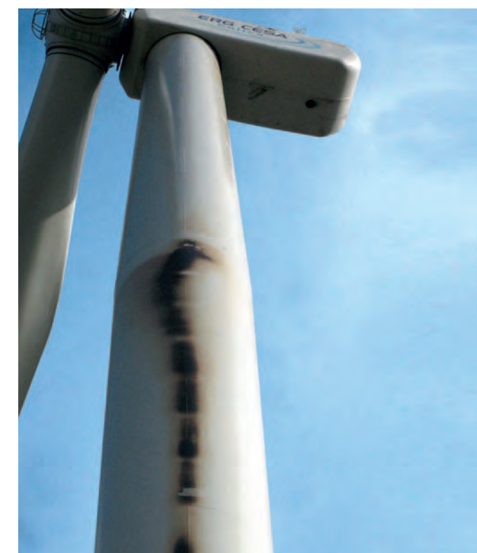
Visible fire damage on the exterior of the tower

An 80-metre-high tower in which four languages are spoken is something unusual, even for BELFOR! However restoration means coordination and communication! This was certainly true for a case involving a French wind turbine, on which a cable fire had initially damaged the switching cabinets and spread contamination throughout the entire tower. Accordingly, BELFOR shared out the benefits of its international network: the manufacturer notified the German BELFOR Reletronic, and from here the message was relayed to French colleagues who pulled out all the stops to get a crew on site immediately. However, the term ‘immediately’ is relative when the nature and extent of the damage is – to put it mildly – “difficult”. The preparation work alone, for instance, took three weeks: specialist equipment had to be obtained, French team members specially trained and three platforms completely replaced. Six days a week, all of the members of the team worked for up to nine hours a day to meet an extremely tight deadline and while wearing heavy safety and protection equipment, but their efforts paid off. The “Tower of Babel”, where there was clear communication despite four different languages being spoken, will be back in operation at the start of the autumn.