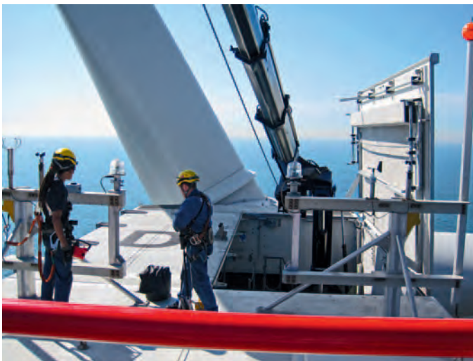
In action on an offshore system

The restoration of a wind turbine becomes even more complex if our experts not only have to “hang around”, but also have to work above water – such as on an offshore wind turbine in the North Sea. A technical fault had caused gear oil to leak and had damaged some of the nacelles as well as a number of the system's external parts. BELFOR was commissioned with cleaning the inside and outside of the tower to prevent oil leaking into the North Sea. Thanks to our maritime expertise and flawless collaboration with the customer, the entire system was fully restored in just three days – with not a single unnecessary drop of oil spilt.