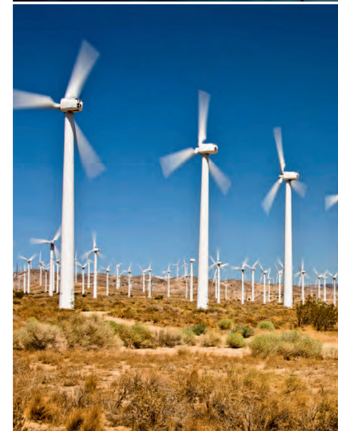
Users of fossil fuels are facing strong headwinds – onshore and offshore